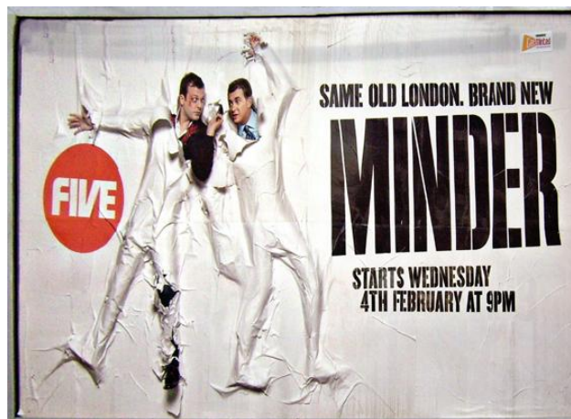
Figure 4: An example of UK outdoor advertising that exploits the unique characteristics of the medium

advertising materials often do not adequately exploit its unique properties (Esteo, 2003:11) to contribute to this ‘single, coherent message’, but are instead adapted (with varying degrees of effectiveness) from other media vehicles (e.g. stills from television commercials, or images from magazine or newspaper advertisements). As a consequence, it may be that the visual and communicative power of outdoor advertising is undermined and therefore does not adequately fulfil its role within the Promotion Mix.