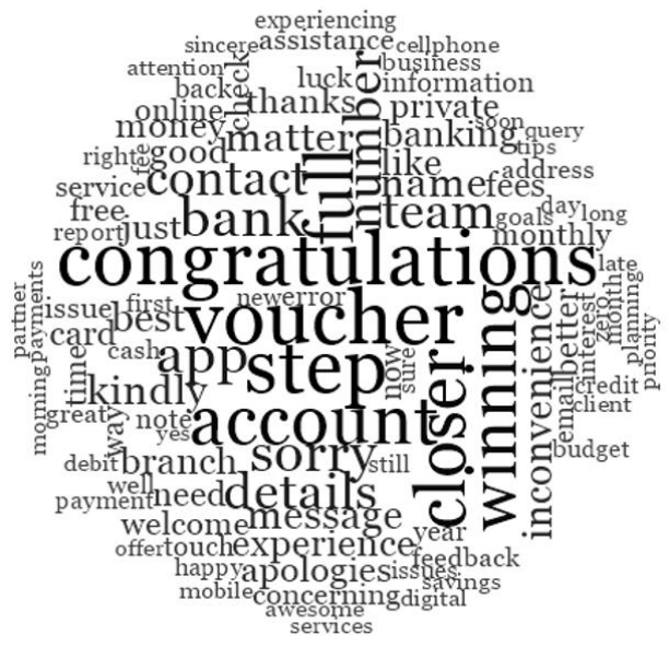
Figure 1. Word cloud of the most frequent words in the dataset

The initial corpus consisted of a total of 985,796 words but after data cleaning it included 396,955 words spanning 13 to 34 words per sentence. First National Bank tweeted the most during the period of analysis, followed by African Bank–as depicted in Table 1 .