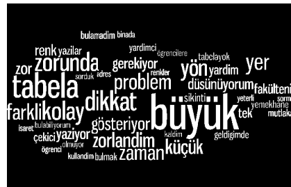
Figure 2. Word cloud visualization with reduced words (max. 50)

The word cloud visualization tool at www.wordle.net is used in the study. Since they do not make any contribution to the analysis, words such as I think... , partly , another , many , some have been removed from the visualization. The effect of most descriptive terms such as find , couldn't find , trouble , help , hard , easy which is important for research has been increased. The similar words shown in Figure 1 are regulated and number of words is reduced in Figure 2. This visualization can be presented in a different color combination or black and white colors.