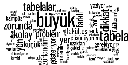
Figure 1. Word cloud visualization

The study is based on the hypothesis that high frequency words in the text express important topics for users. Word cloud visualization is a technique suitable for this purpose because it shows the relation between words frequency and size. Color is not a determining/separating element. Similarly, the location of the words in the composition is not a determining factor, too.